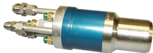
104001-002 Straight Manifold