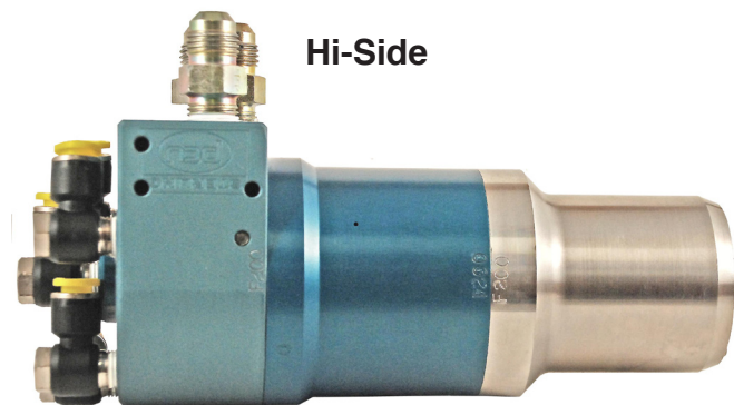
104001-004 90° Manifold

Reduce labor content and minimize emission of refrigerant to the atmosphere!